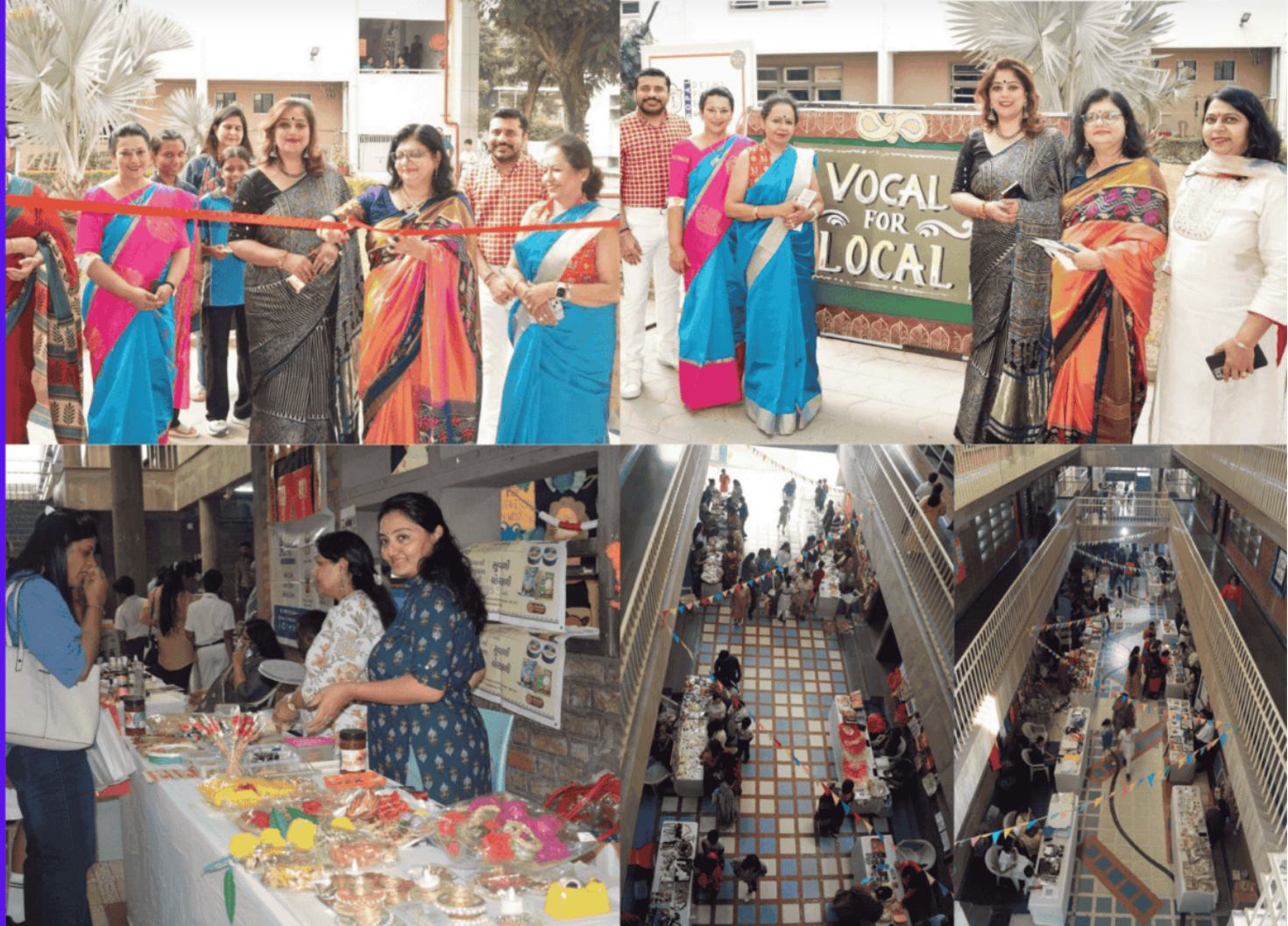
Spreading Smiles Through Local Support: A Celebration of Indian Artisans