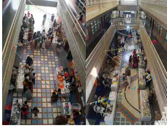
A bird's eye view of the special market-NE photo

This meaningful initiative not only revived interest in locally produced goods but also fostered a deeper understanding of the importance of building inclusive, diverse, and equitable communities. It reminded us all that by supporting local businesses, we contribute to a more sustainable and resilient future for our country.